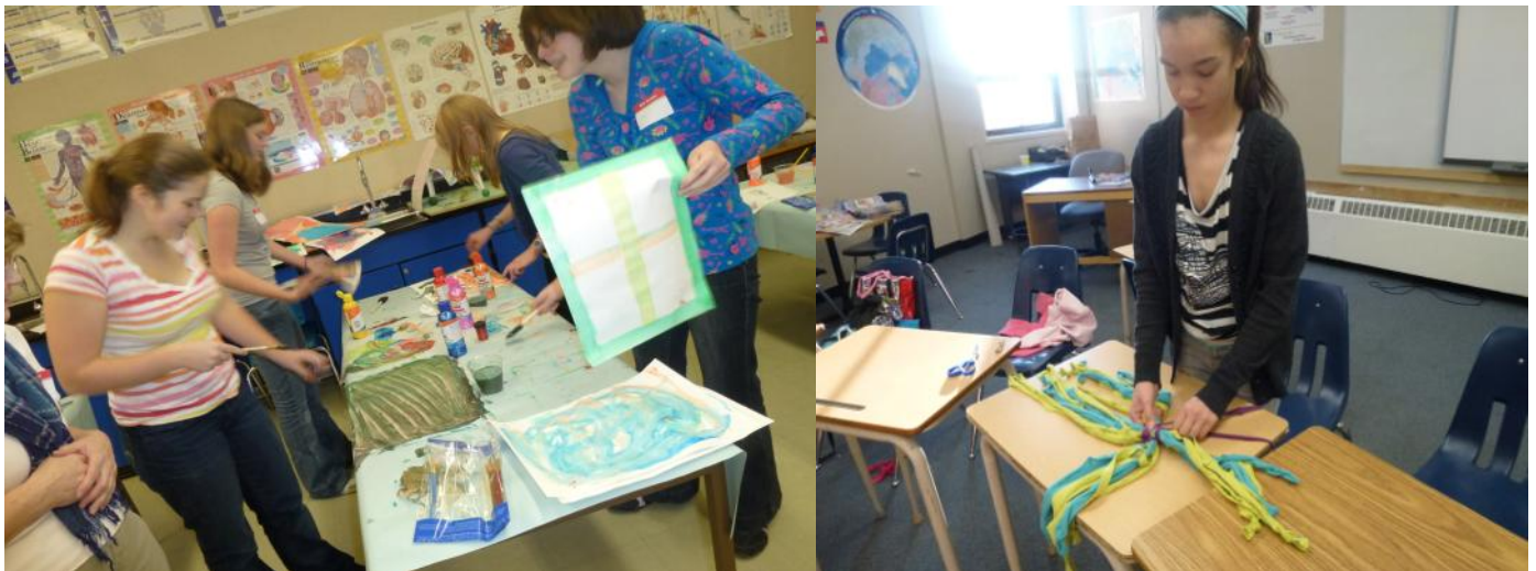
Students working hard on their books as well as creating a basket out of strips of t-shirts