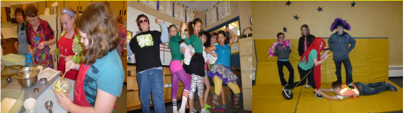
Home Ec and 2 pictures of the Survivor Exploratory