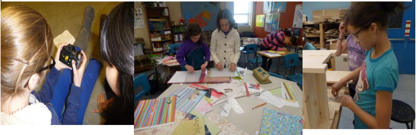
Our photography, scrapbooking and wood working Exploratories.